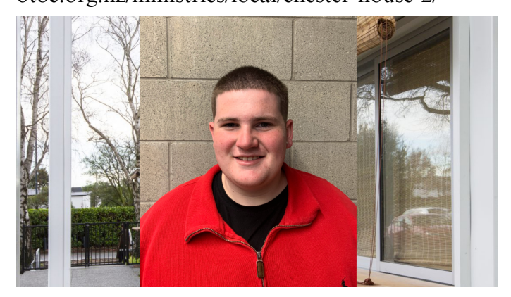
"For me, Chester house has been a very welcoming space during my first year out of home. It has been a great experience to be able to share with each other through cooking shared meals or in conversation."

We are currently looking for a new crop of flatmates to join Chester House in 2024, so if you know of a young person in your family or church who is moving to Christchurch for study or work, let them know about Chester House. Applicants must be Christians aged 17-20, moving to Christchurch for study or work from elsewhere in the country and beginning their first year of flatting. For more information, see the Chester House page on our church website: otbc.org.nz/ministries/local/chester-house-2/